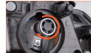
Fig. 3: Inset the lamps, turn them clockwise, then clamp tightly.