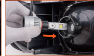
Fig. 4: Insert the lamps into the retainer holder with correct position. Note: Line up the tiny tab of LED lamps with the slot of retainer holder.