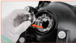
Fig. 1: Remove the dust cover and the OE Halogen bulb. Hold the base of the lamps and turn counter-clockwise until it is unlocked, and then remove the OE Halogen bulb;

Installation instructions (Take H4 as an example)