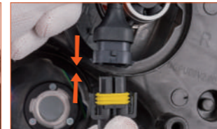
Fig. 4: Connect the power line.