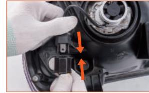
Fig. 5: Please double check the “+/-” polarity before connecting the plug. (only for H7).