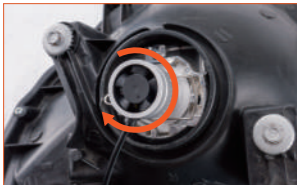
Fig. 4: Rotate the heat sink to get a better beam pattern (It will get a best beam pattern if the LED chips face 3-9 o'clock.)