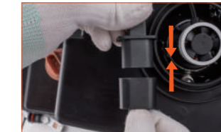
Fig. 3: Connect the power line.