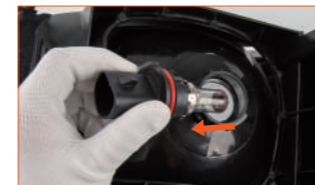
Fig. 1: Remove the bulb retainer and OE halogen bulb from the vehicle.