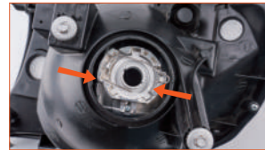
Fig. 2: Insert the retainer holder into the assembly slot, match the tabs with slot, and lock the retainer holder with the buckle;