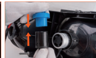
Fig. 6: Connect the power line.