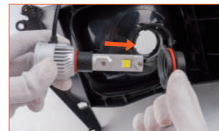
Fig. 2: Take apart the retainer holder from LED lamps.