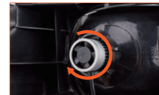
Fig. 5: Rotate the heat sink to make it tight (If the high beam and the low beam reverse, take the bulb out and rotate it 180 degree, and then install it again.)