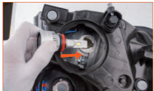
Fig. 2: Line-up the tabs with the slots of the assembly. Warn: the tabs are asymmetrical.