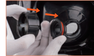
Fig. 3: Assemble the retainer holder with the bulb retainer together, and then insert them into the assembly.