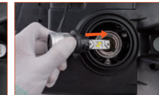
Fig. 2: Insert 9008/H13 into the assembly and rotate it clockwise, then lock it.