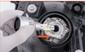
Fig. 3: Insert the lamps into the retainer holder with correct position.