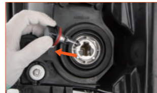
Fig. 1: Remove the dust cover and the OE halogen bulb.