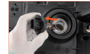
Fig. 1: Remove the OE halogen bulb