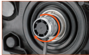
Fig. 3: Insert the lamps , turn them clockwise, then clamp tightly.