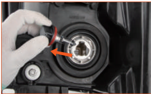
Fig. 1: Remove the dust cover and the OE halogen bulb.