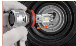
Fig. 2: Line-up the tabs with the slots of the assembly. Warn: the tabs are asymmetrical.