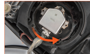
Fig. 3: Locate the HID bulb, and unplug the ballast. You may need to turn the plug counterclockwise and pull it out;

Fig. 2: Open the hood, locate the bulb that needs to be replaced, and remove the back cover (the ballast and the back cover are one piece for most vehicle models), which you may need to rotate or pull out;