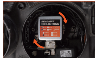
Fig. 5: Fasten the bulb in place by turning it clockwise;