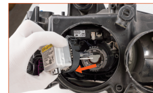
Fig. 4: Take out the HID bulb;

Fig. 3: Locate the HID bulb, and turn counterclockwise or loosen the spring to remove the bulb. Locate the HID bulb, and turn counterclockwise or loosen the spring to remove the bulb;