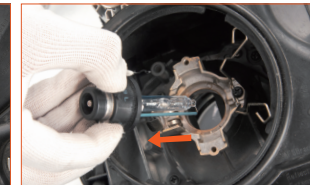
Fig. 4: Open the spring fastener, and take out the bulb;