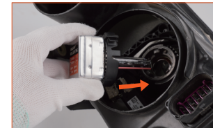
Fig. 6: Install the new HID bulb into the assembly;