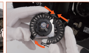
Fig. 5: Install the lock ring into the chuck of the HID bulb.