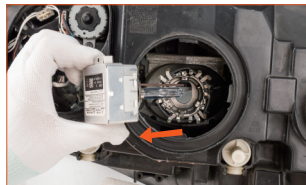
Fig. 3: Locate the HID bulb, and turn counterclockwise or loosen the spring to remove the bulb. Locate the HID bulb, and turn counterclockwise or loosen the spring to remove the bulb;

Fig. 2: Open the hood, locate the bulb that needs to be replaced, and remove the dust cover (the ballast and the back cover are one piece for most vehicle models), which you may need to rotate or pull out;