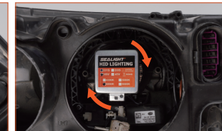
Fig. 7: Turn clockwise to secure the bulb;

Fig. 8: Close the back cover and close the Engine Hood, then you are done.