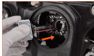
Fig. 4: Connect the new HID bulb to the plug, and then install it into the assembly, pay attention to align the positioning slot when installing;